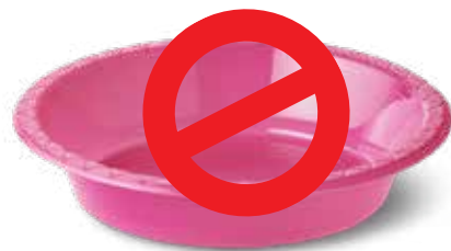
Single-use Plastic Bowls