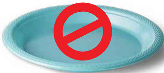
Single-use Plastic Plates

These products will be phased out by September 2023