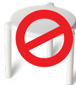
Plastic Pizza Savers